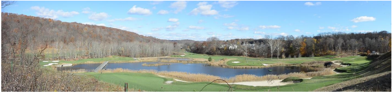
Figure 3. The Hollow Brook Golf Course in Cortlandt on the land where the September 4 th , 1949 concert was held (November 2015).

Tayo Aluko stated to a local news source: